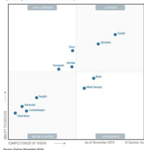
Figure 1. Magic Quadrant for Secure Web Gateways

“We have over 350,000 employees in 192 countries in 2,200 offices being secured by Zscaler.”